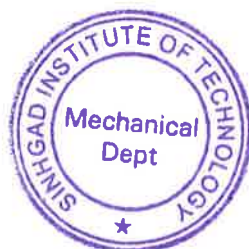
HEAD Dept. of Mechanical Engineering S.I.T., Lonavla-410 401.